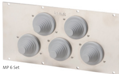
MP 6 Set